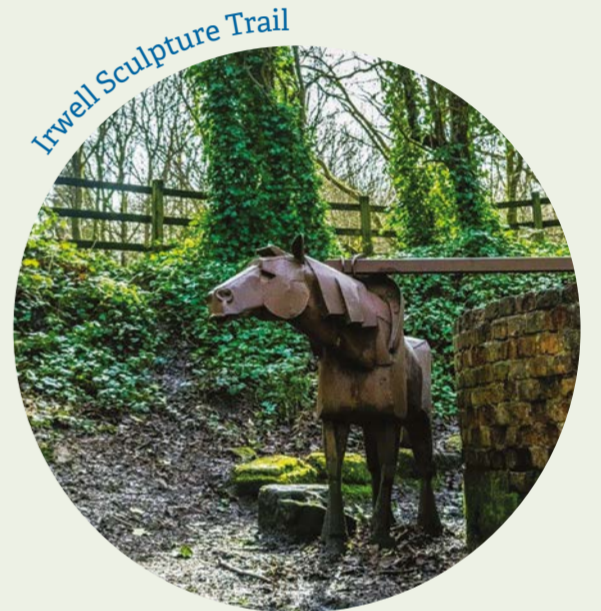
Irwell Sculpture Trail