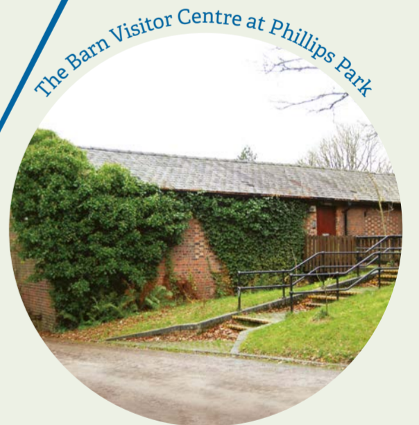
The Barn Visitor Centre at Phillips Park