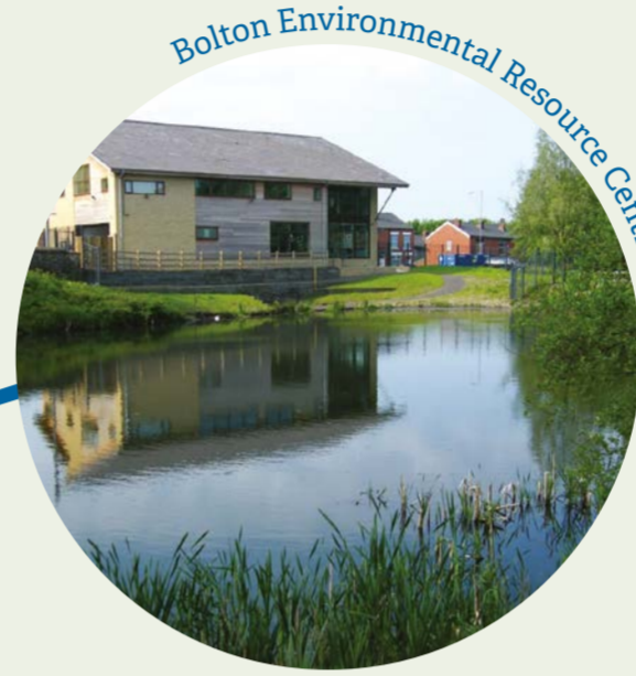
Bolton Environmental Resource Centre