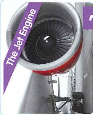
The Jet Engine