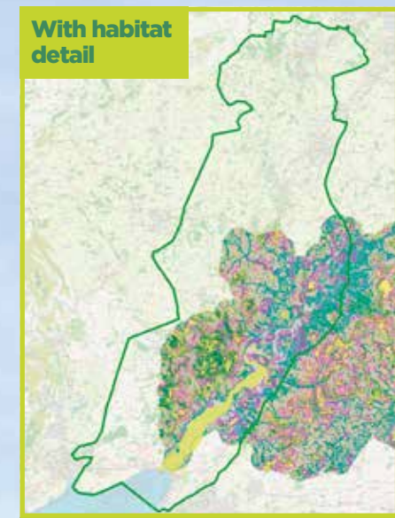
Gloucestershire has already completed its Nature Recovery Map