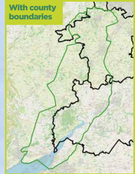
English contributors Worcestershire (top) and Gloucestershire