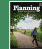
Cover picture: Trumpington Meadows - a development of 1200 houses with recreated grassland, wetland and green infrastructure

It's the only way to rebuild public trust in planning