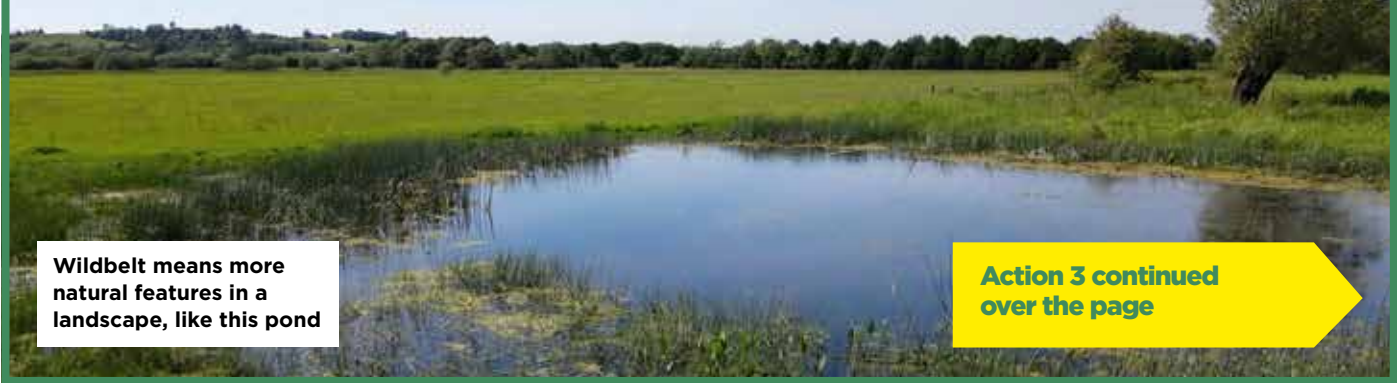
Wildbelt means more natural features in a landscape, like this pond

people live. For example in the Severn Vale, this transformation (left) is centred on the river’s floodplain – an area where enormous transfers of energy and biomass take place. Allowing more natural processes there will provide ecological, social and economic benefits far into the future. Within such areas, the sites where nature is recovering should be protected from future destruction by being designated as Wildbelt.