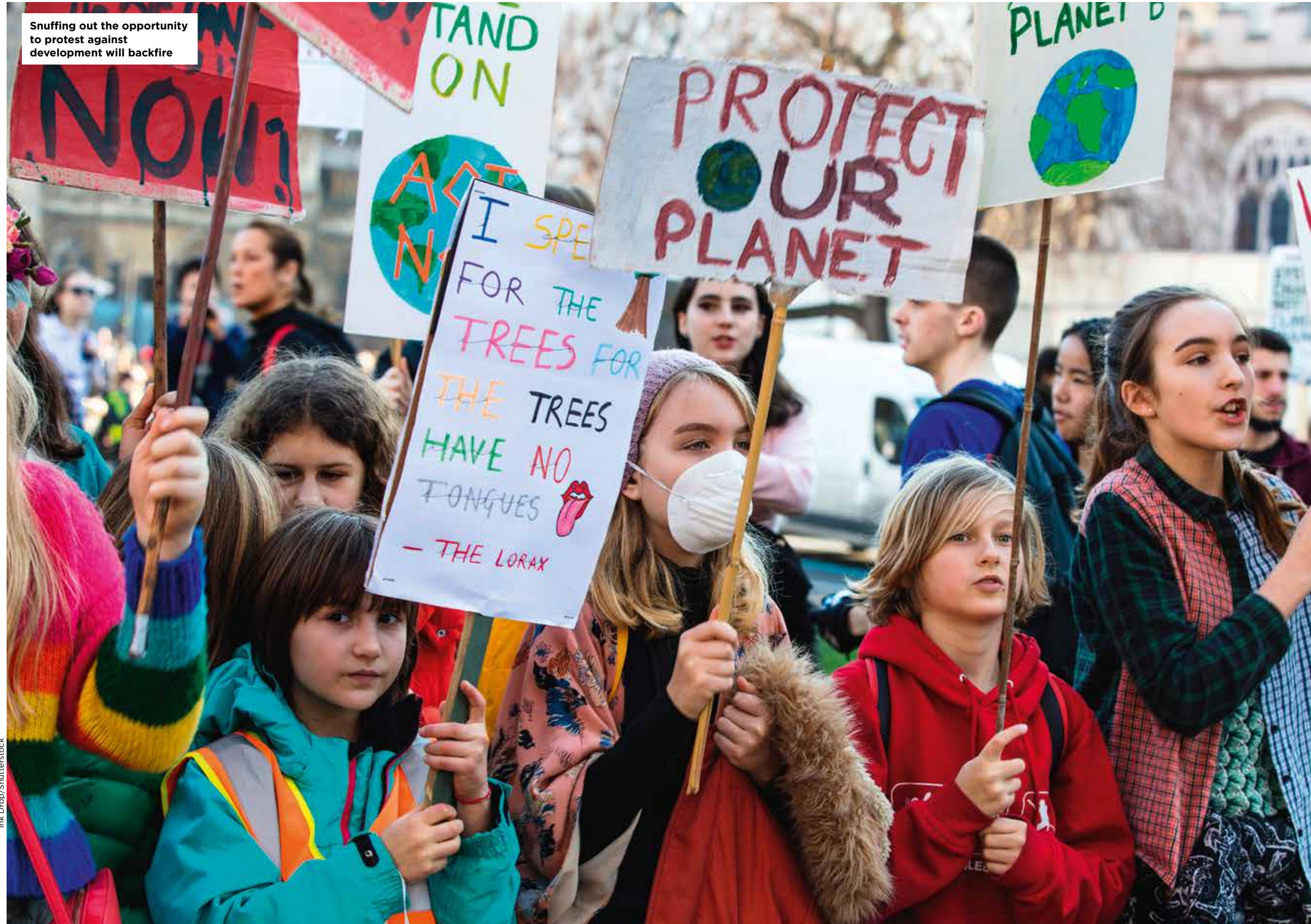
Snuffing out the opportunity to protest against development will backfire

“The Planning Bill must enable the public to challenge or support development when proposals come forward.”