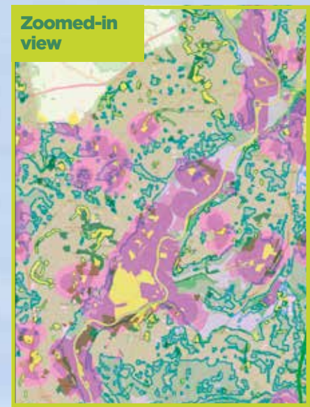
Here is a detail from the map, close to the town of Tewksbury

For nature to start to recover, it needs a large land area which is allowed to function in a semi-natural way for the benefit of people and wildlife. Such wilder areas would provide us with ecosystem services: for example absorbing carbon, reducing flooding, providing cleaner water, boosting biodiversity and improving climate resilience. In a country as densely populated as England, nature’s recovery cannot be confined to remote uplands, but also where